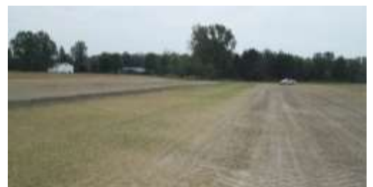
Grassed waterways are shallow channels designed to carry water and prevent erosion.

Now it is time to turn our attention to the future as we have turned our calendars over to 2015. With that in mind, we encourage you to get your requests for waterways in as soon as possible. Waiting until late spring to ask for assistance does not leave much time to get the area surveyed and designed. So, when you are bouncing through those trouble spots in your fields, just give us a call or stop by so we can start the design process.