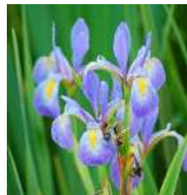
Blue Flag Iris