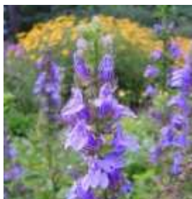
Great Blue Lobelia