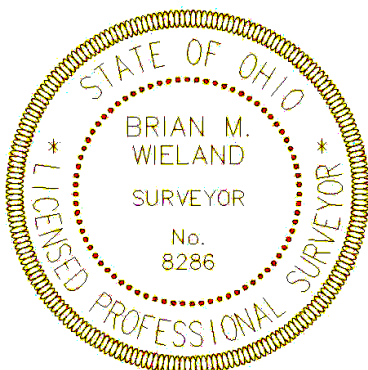
Brian M. Wieland Registered Surveyor No. 8286

Bearings and distances are based on State Plane Coordinates, SPC83, Zone-Ohio North. Monuments described above as "Iron Pin Placed" are 5/8-inch diameter by 30-inch rebar with yellow plastic cap stamped "Wieland-8286."