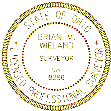
Brian M. Wieland Registered Surveyor No. 8286

Bearings and distances are based on State Plane Coordinates, SPC83, Zone-Ohio North. Monuments described above as "Iron Pin Placed" are 5/8-inch diameter by 30-inch rebar with yellow plastic cap stamped "Wieland-8286."